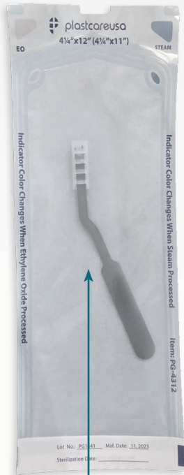
SurePass™ CTR Non-Sterile Blade