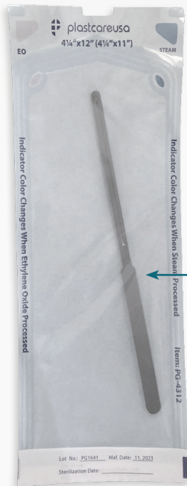
SurePass™ CTR Non-Sterile Guide

Non-Sterile Guide ..... CT-2000NS (1ea.)